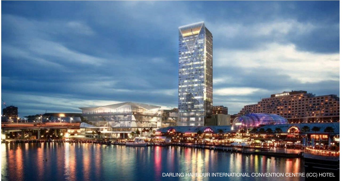
DARLING HARBOUR INTERNATIONAL CONVENTION CENTRE (ICC) HOTEL

Warren Smith & Partners Pty Limited, Consulting Hydraulic, Fire and Civil Engineers, was incorporated and registered on the 10th August, 1981. We have been involved with over 5,800 projects of all development classifications and scale. Our project experience extends to not only NSW, but throughout Australia and abroad.