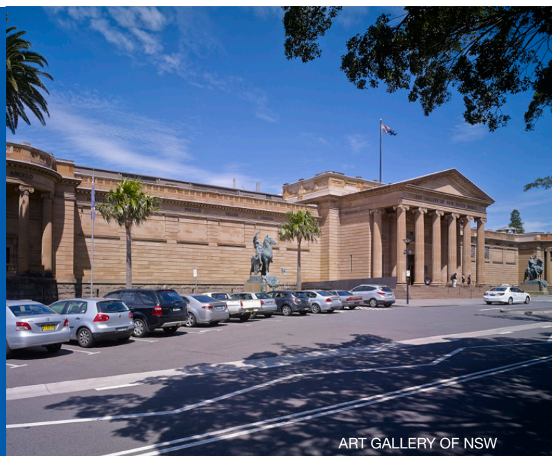
ART GALLERY OF NSW