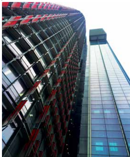
INTERNATIONAL TOWERS SYDNEY, TOWER 1 BARANGAROO