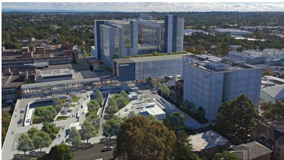
WESTMEAD HOSPITAL REDEVELOPMENT STAGE 1

We hope you enjoy the open, friendly, yet professional and skilled culture of our team, when embarking on your next project.