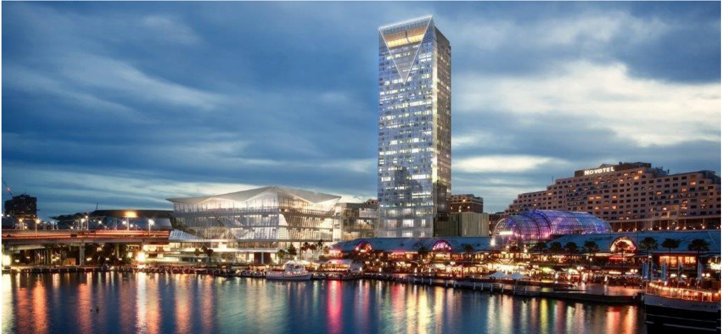
DARLING HARBOUR INTERNATIONAL CONVENTION CENTRE (ICC) HOTEL

Warren Smith Consulting Engineers (Hydraulic, Fire, Civil and Utilities Infrastructure), was founded on the 10th August, 1981.